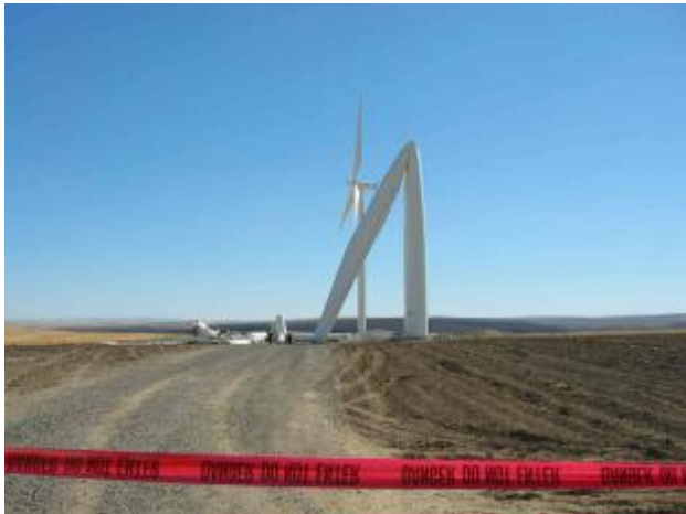
August 2007 tower collapse