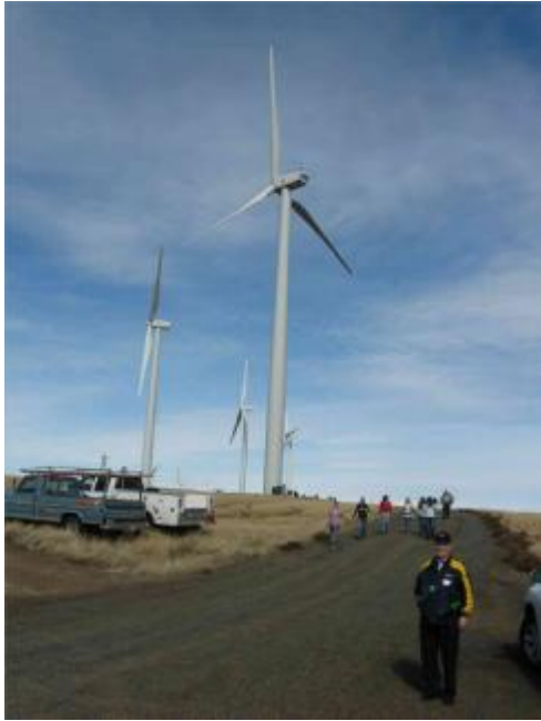
Blaine on tower road